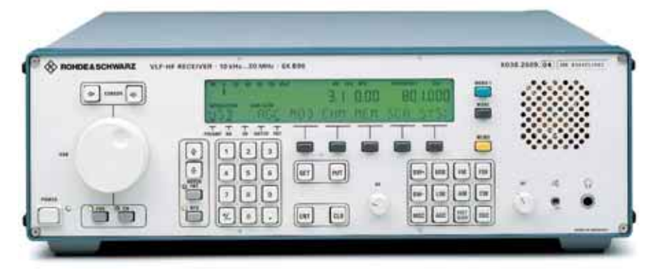
Search Receiver R&S EK896 with front panel for local/remote control

The high-performance mixer at the receiver input ensures excellent large-signal behaviour. The intercept points are typically +70~\mathrm{dBm}~(\mathrm{IP_2}) and +35~\mathrm{dBm}~(\mathrm{IP_3}) ; the crossmodulation transfer is 10% for an interfering signal of +21~\mathrm{dBm} . In most cases, additional filters such as sub-octave filters are therefore not required.